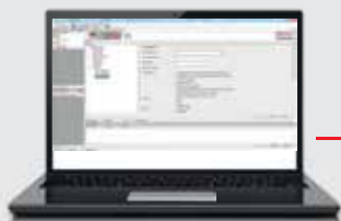
PC/tablet Asset Management Software

The PR backplane offers HART multiplexer access for asset management of all HART equipment including monitoring, status, re-calibration and configuration.