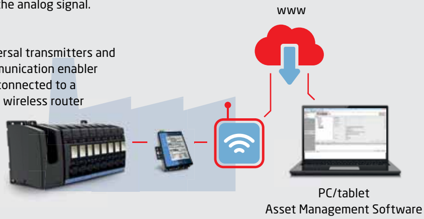
PC/tablet Asset Management Software

Backplane with 8 x PR 9116 universal transmitters and 8 x PR 4511 communication enabler The backplane is connected to a PR gateway and a wireless router